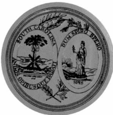
MARK SANFORD Governor

Handwritten signature of Mark Sanford in black ink.